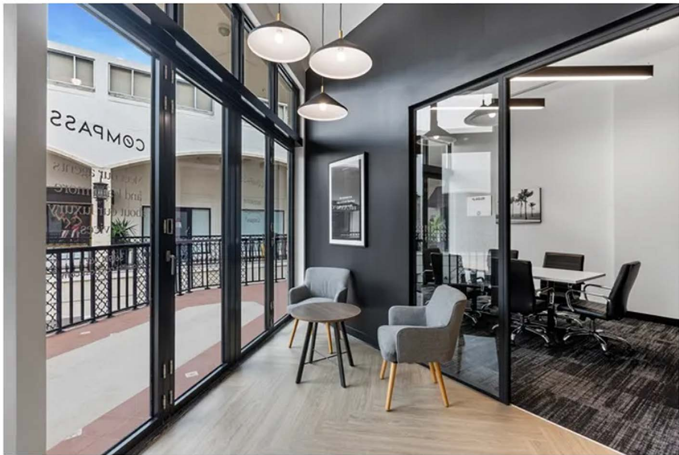
Compass Florida's new second-floor office overlooks the interior courtyard of The Esplanade on Worth Avenue in Palm Beach. The real estate agency was previously located across town on Sunrise Avenue.