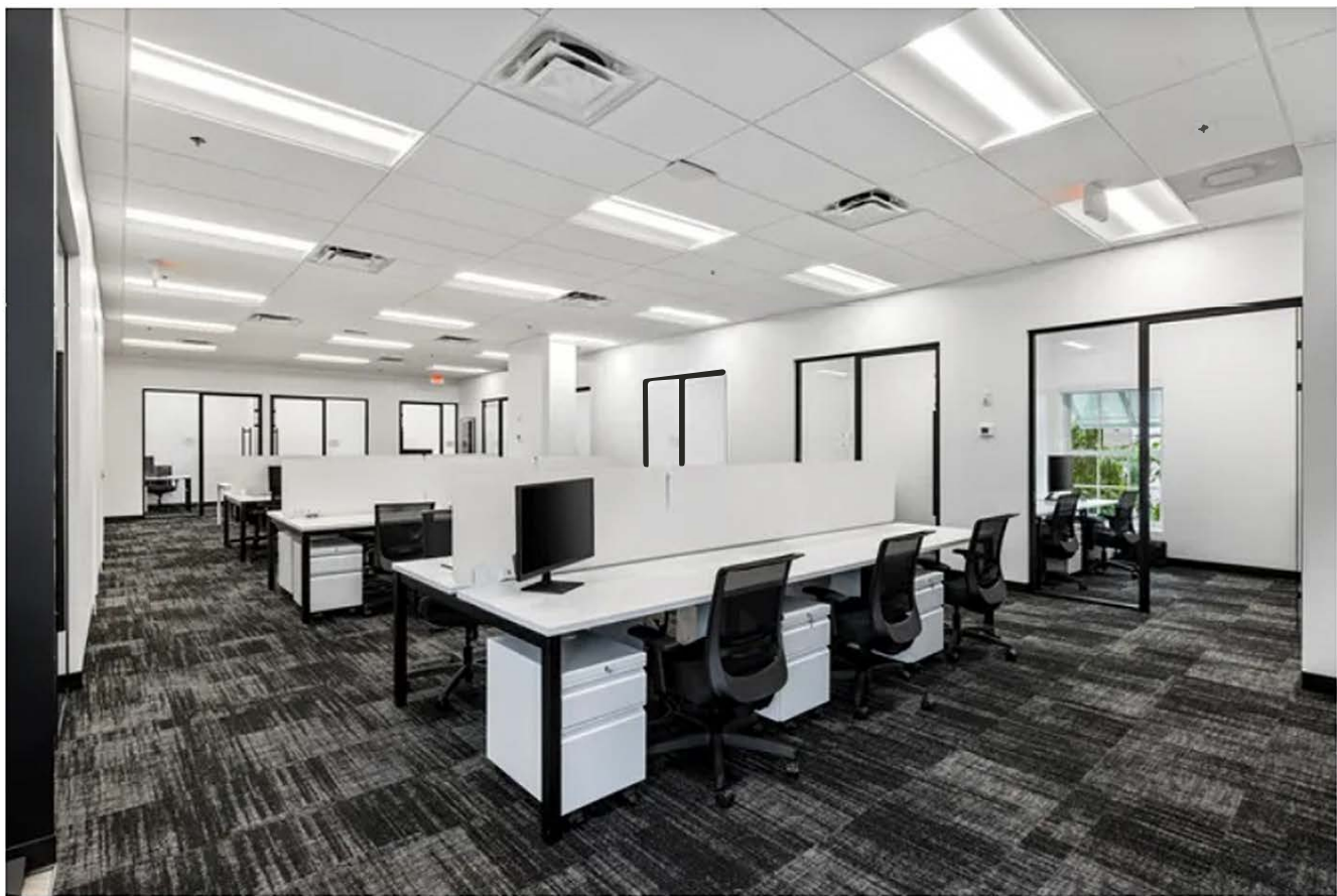
Compass Florida is the first non-restaurant business to the second-floor suite at The Esplanade since the the shopping center opened in 1980 on Worth Avenue in Palm Beach.